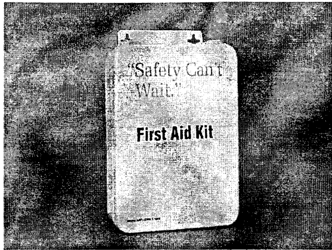
Figure 1 - First Aid Kit