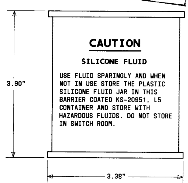
▶ Fig. 1—KS-20951,L5, Can ♦