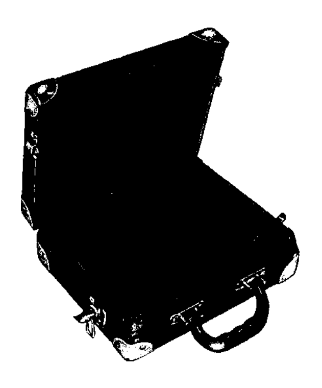
The KS-21232 L10 case is used for storing the KS-21232 L1 (electric) wire wrapping gun and must be ordered separately.