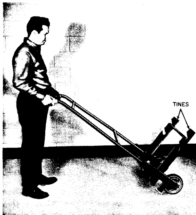
Fig. 1—R-3953 Cable Reel Carrier

2.04 The height of the R-3953 Cable Reel Carrier is 62-1/2 inches and the overall width is 26 inches. It weighs 75 lbs.