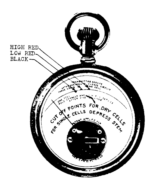
Fig. 1 - 35 Gauge

3.02 Adjust the rheostat to give about one-half scale deflection of the gauge needle and move the gauge cords gently one at a time in various directions. If the motion of a cord causes fluctuation of the needle, the cord is defective and should be replaced before proceeding with the remaining tests.