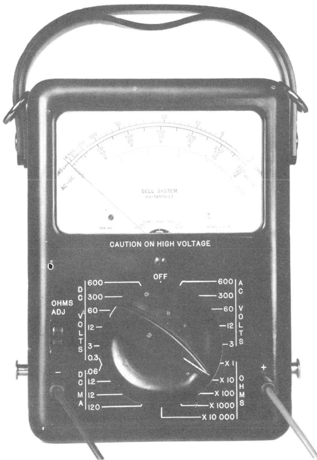
Fig. 2 – KS-14510 Volt-ohm Milliammeter

Caution: Do not remove board E when making voltage measurements covered in 2.02.