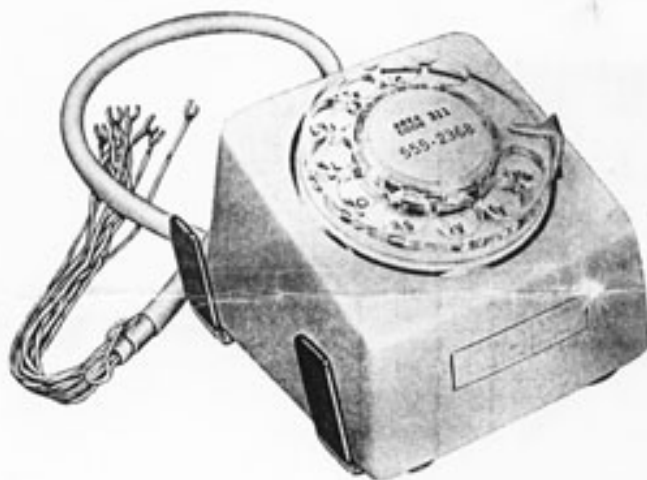
Fig. 1 — 1008B Dial

1.01 The 1008B dial (Fig. 1) consists of an 8B rotary dial in a special molded housing containing terminations for a D10R cord which is used to connect it to an adjacent telephone set. Illumination is provided by either a 51A or 53A lamp when connected to a 10-volt source.