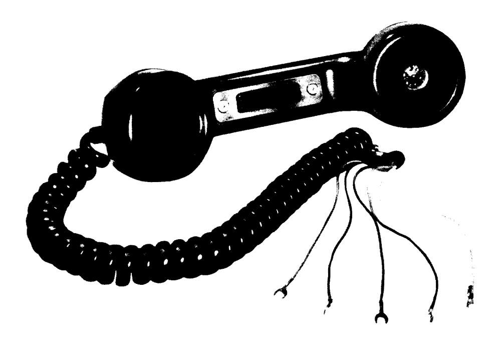
Fig. 1—J1A Handset