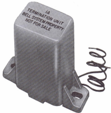
Fig. 1—1A Termination Unit

3.02 The 1A termination unit is connected across the line as shown in Fig. 2.