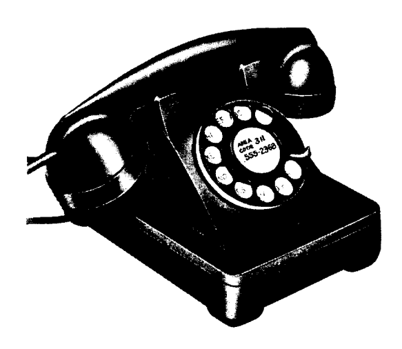
Fig 1 — Telephone Set, Exterior

1.03 The 329A is used for manual operation, and the 329C is used for dial operation (Fig. 1).