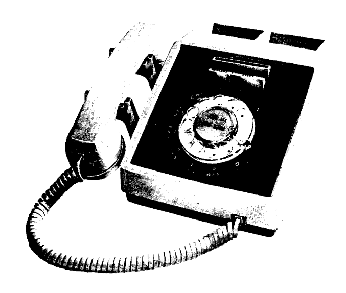
Fig. 1-660A1M Telephone Set