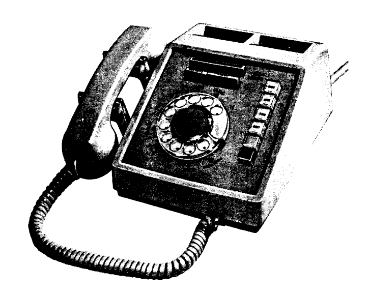
Fig. 1—662A1M Telephone Set