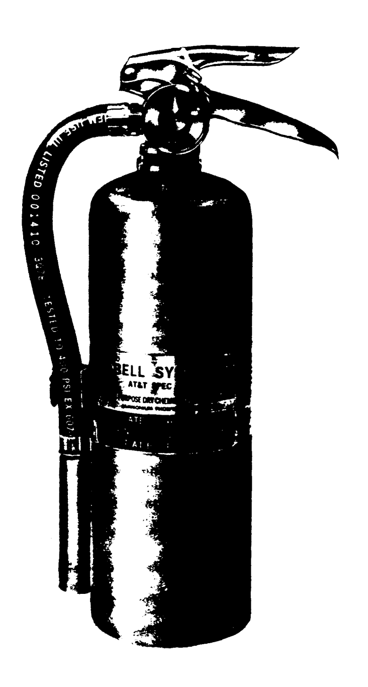
Fig. 3—E-12, Multipurpose Dry Chemical Extinguisher

where protection is needed for telephone equipment. CO<sub>2</sub> extinguishers have a relatively short range (3 to 8 feet) and are most effective when used within a few feet of the fire, or as close as is safe for the operator. The gas extinguishes by its smothering action and has no appreciable cooling effect. This type of extinguisher is, therefore, not recommended for outdoor use where windy conditions prevail.