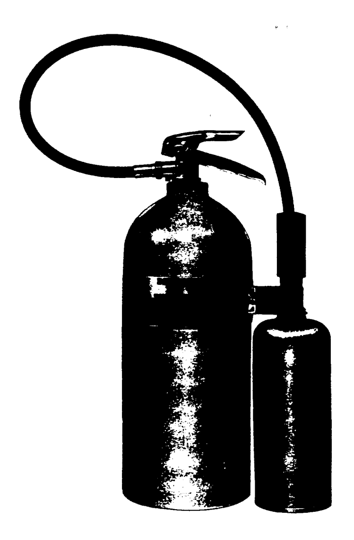
Fig. 2—E-6, Carbon Dioxide Extinguisher