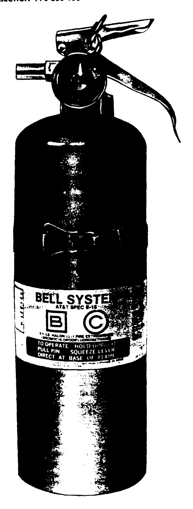
Fig. 4—E-15, Halon 1211 Extinguisher

and the unit is rated 4A:40B:C. It is used in garages and work centers. The fire extinguishing agent for both extinguishers is usually a very finely divided chemical composed of ammonium phosphate and other added chemicals to provide for free-flowing capabilities.