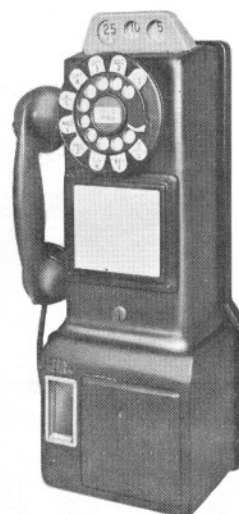
FIG. 1—193GL, HL DIAL SET—EQUIPPED WITH APPARATUS BLANK

2.02 The 193GL and HL coin collectors are used with the 634YD subscriber set when its use does not conflict with the requirements in 2.01.